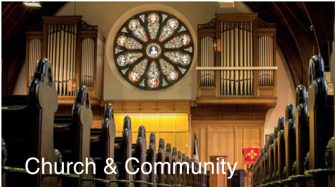
Church & Community