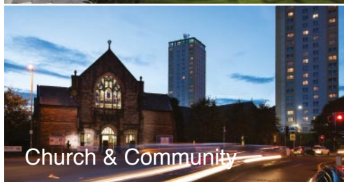
Church & Community