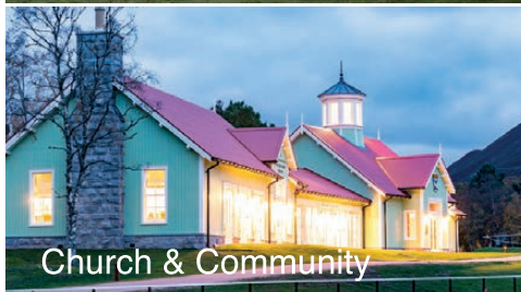
Church & Community