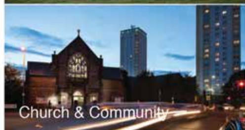
Church & Community